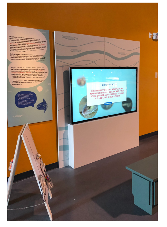
Conclusion and touchscreen game area